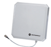
AN480 RFID antenna

To accurately track tagged items, automated RFID reading portals were designed by RFID Global Solution, who installed FX7400 RFID readers and AN480 RFID antennas at thirty equipment and stockroom doorways, and doorways of the six operating rooms in the Cardiovascular Laboratory.