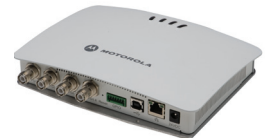
FX7400 RFID Reader