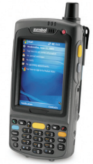
MC70 Mobile Computer

To accurately track tagged items, automated RFID reading portals were designed by RFID Global Solution, who installed FX7400 RFID readers and AN480 antennas at thirty equipment and stockroom doorways and doorways of the six operating rooms in the Cardiovascular Laboratory. These portals allow the system to track the presence and movement of inventory without requiring staff to actively scan an item. When a tagged item passes through a portal, the readers and antennas wirelessly and automatically read the information and pass it to the Cenbion software, which records the tag number along with the time and location. This process helps pinpoint the location of every traceable item, from stockroom to operating rooms to the trash.